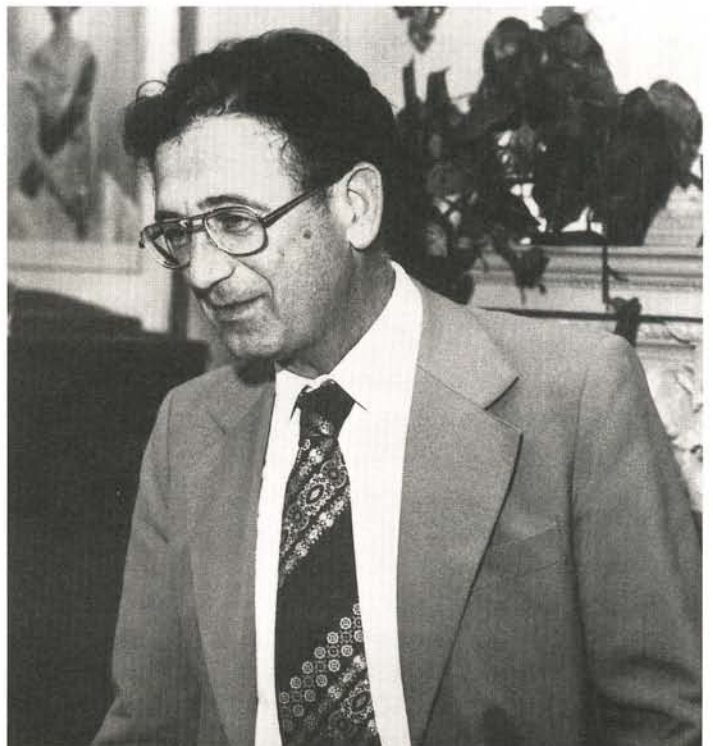
Holocaust Historian Yehuda Bauer

Books written by Professor Bauer include The Holocaust in Historical Perspective , American Jewry and the Holocaust , and most recently, Jews For Sale? Nazi Jewish Negotiations 1939-1945 .